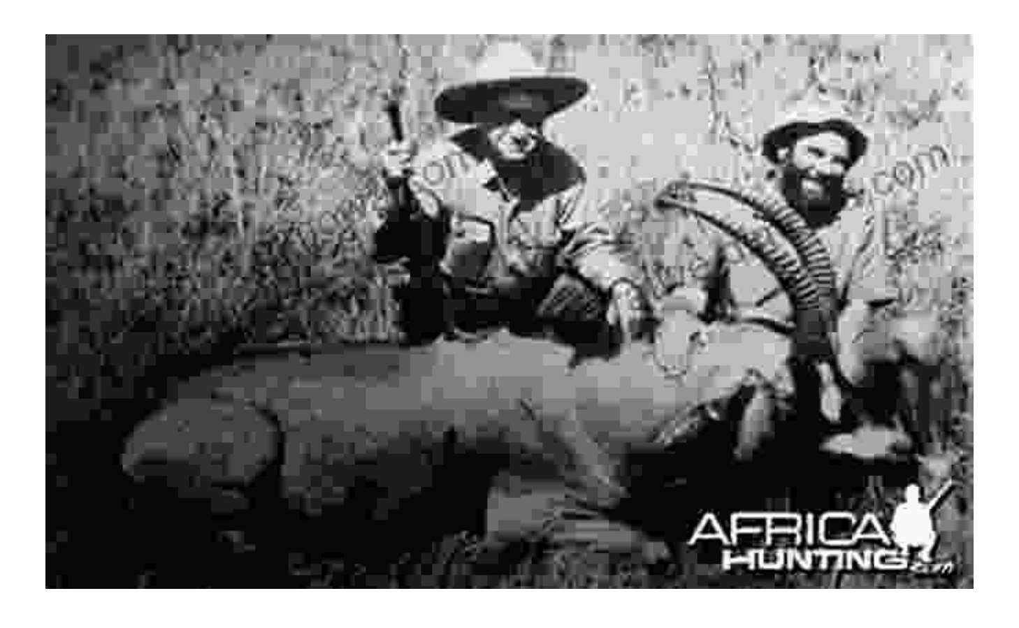
Early Life and Hunting Career