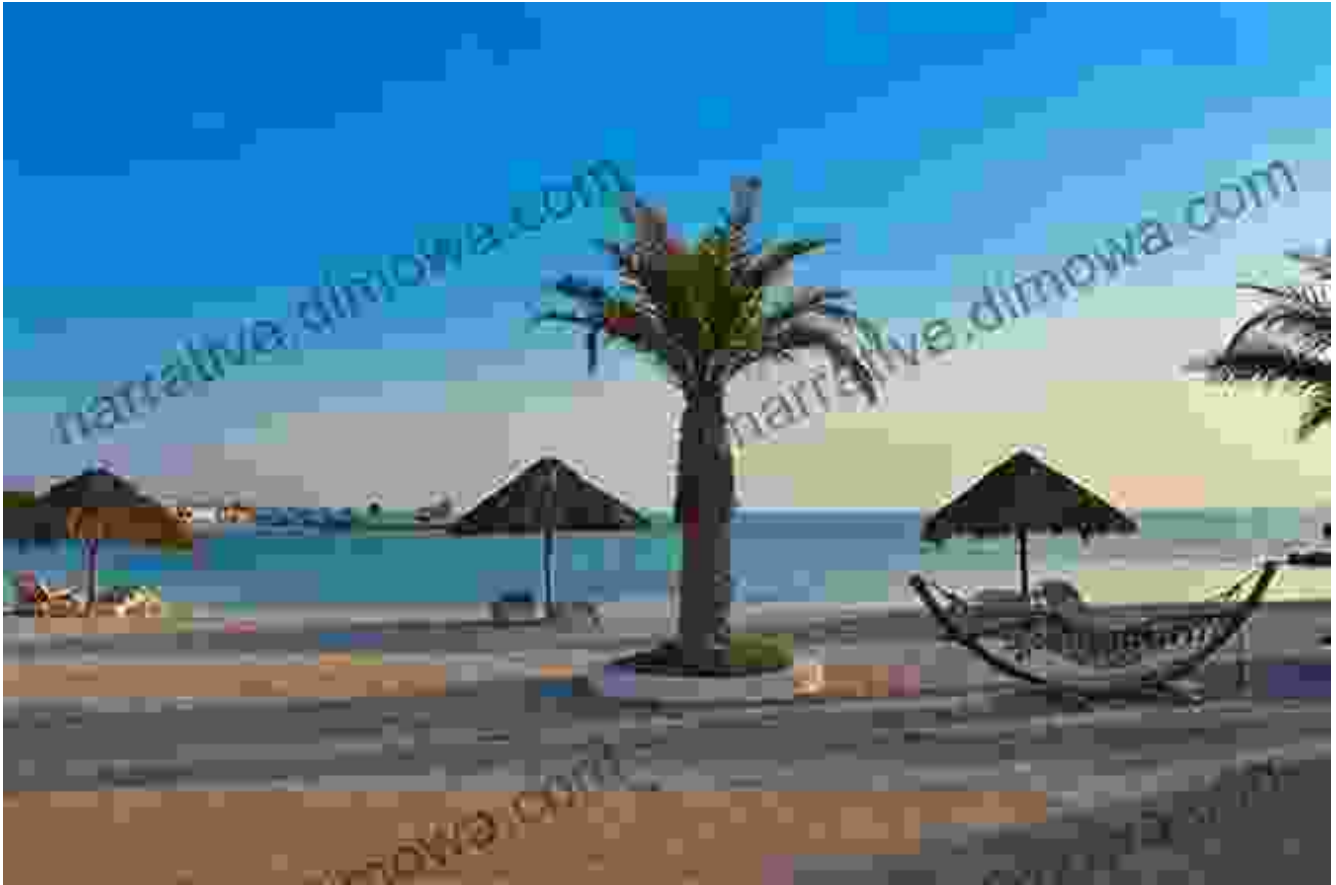
Bahrain's Pristine Beaches