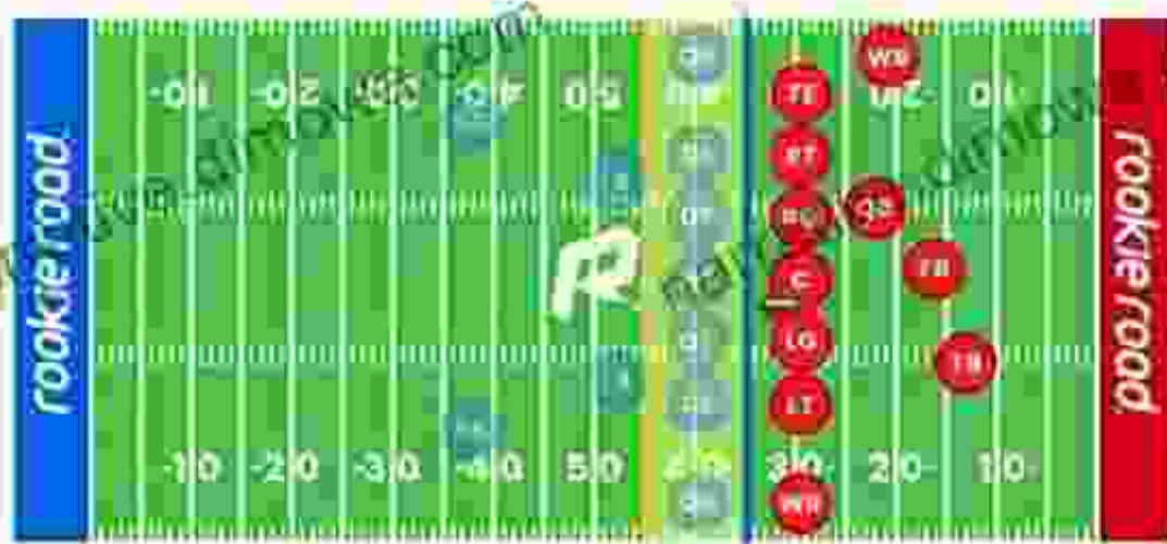
Football Single Wing Formation